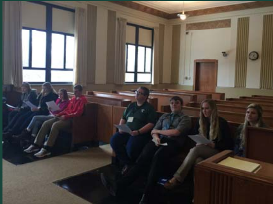
Youth Leadership Members learning about the Judicial System

Preparing youth for the workforce and leadership opportunities is an important economic development tool for any community.