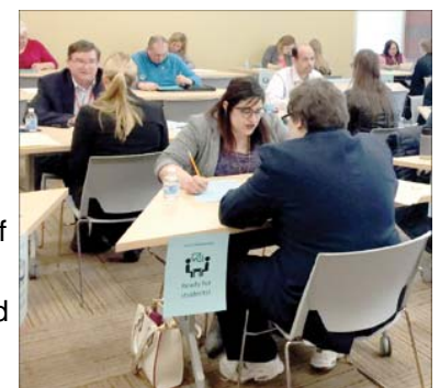
Professional volunteers ask questions of high school students as part of Mock Interview Day

In March each year, MSU Extension and community partners provide a “Mock Interview Day” for students to practice interview skills and network with the business community. Students are expected to bring a completed resume, job application or portfolio, and dress appropriately for an interview. Students receive individual feedback on their resume and interview. They become more prepared for job-seeking as a result of this experience. Gladwin and Beaverton high school seniors attended the 2018 Mock Interview Day at Mid Michigan College in Mt. Pleasant. Over 350 students participated from 3 counties, with over 75 volunteer community business representatives. There were sessions available for students to learn more about dress attire, budgeting and additional interview skills.