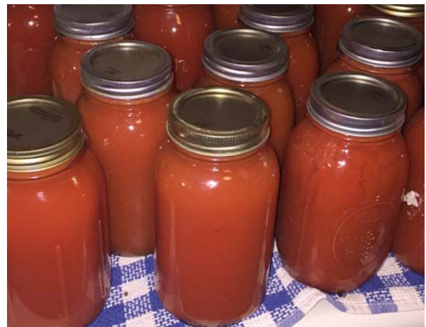
Learning to can using up-to-date safe methods reduces the risk of food-borne illnesses.

Providing assistance to help residents and businesses keep food safe is a hallmark of cooperative extension services across the country. In Gladwin County we provided ServSafe education for restaurant staff, home food preservation (canning, freezing and drying,) teen "chopped" cooking challenge, and pressure canner gauge testing.