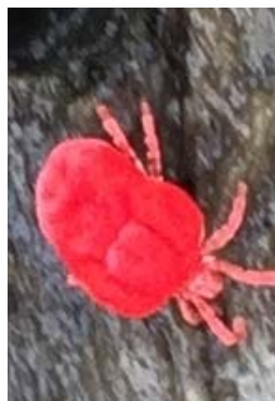
Red Velvet Mite

Two of the many plants and insects that were brought in to the office for identification.