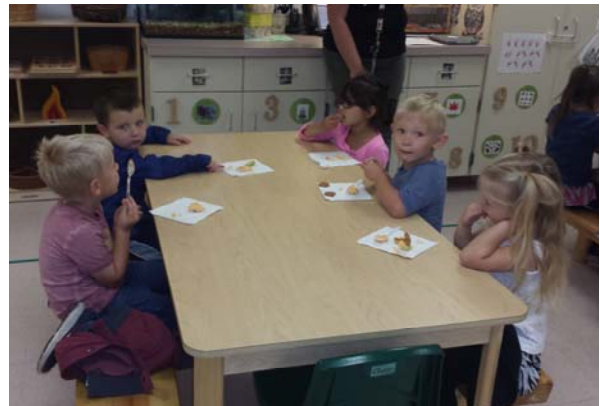
Beaverton preschoolers trying new foods in the "Show Me Nutrition" series.

MSU Extension's Supplemental Nutrition Assistance Program provides basic nutrition education and hands-on activities for all ages. Core curricula are designed to help low-income families stretch their food dollars while maintaining good nutrition. Some instruction includes physical activity and cooking techniques that help instill life-long skills. It is estimated that every $1 spent on nutrition education saves as much as $10 in long-term health costs.